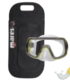
Set Forma 09 (Forma 09 + Z plus) code 411884