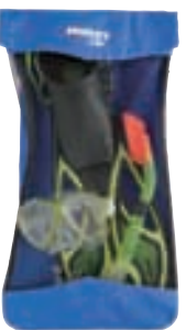
Set Wahoo II / Diablo / Zoom code 410718 SIZE: S, M, L