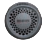
Regulator front cover grey code 416806