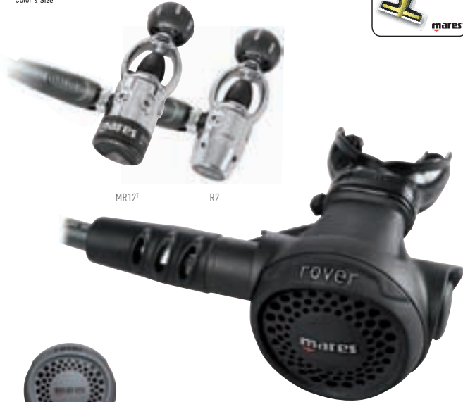
MR12 1 R2