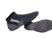
Diving Boots Equator 2mm code 412613