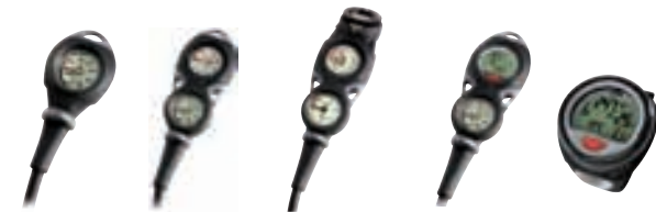
Mission 1 code 414417