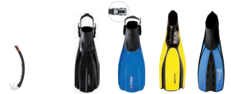
Snorkel Rover Set 12 pcs 4 BLUE, 4 BLACK, 4 YELLOW code 411452