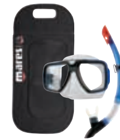
Set Seta 09 (Seta + Samea) code 411883