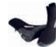
Diving Boots Classic 5mm code 412610