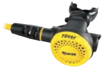
Rover Octopus code 416505